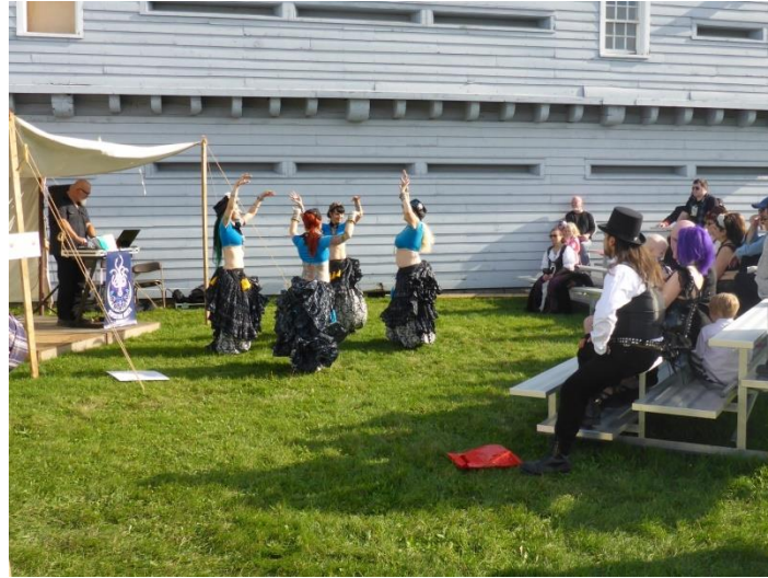
Figure 6. Belly dancers performing at the Grand Canadian Steampunk convention.

The gender imbalance in steampunk is further signalled by the ubiquitous presence of belly dancers; every steampunk convention that I have attended featured belly dancers, including two separate troupes at the 2015 Grand Canadian Steampunk convention (see Fig. 6). There is nothing wrong with belly dancing per se , apart perhaps from its rather dubious connection with Victorian Orientalism, 19 but there is a definite bias in terms of performing bodies. Belly dancing itself is the subject of a debate comparable to that surrounding corsets as to whether the performance represents “the body as a site of pleasure and discovery” or “the sexualised use of the female body and sexual commodification” (Maira 2005: 323). While it is considered unexceptional that women should perform belly dancing at steampunk conventions, there is no masculine equivalent that draws attention to male performing bodies. The belly dancer costume emphasises the woman’s body in performance, especially her hips, whereas the men watching (like the man in the top hat in the audience) are usually fully covered by their costumes, which connote male power rather than sexuality. Perhaps one day there will be greater gender equivalence if steampunk conventions start to include male pole dancing, with men in skimpy outfits proving their prowess and desirability on stage before an admiring audience. Such performances would eroticise men’s bodies in the