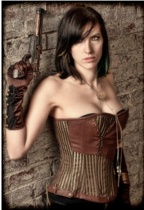
Figure 2. Steampunk costume by Ecajoe; photo shoot with SJ Brink by Joe Alfano,

problem if men were eroticised as well, but there are no partially clothed male equivalents in Steampunk, suggesting a distinct gender imbalance.