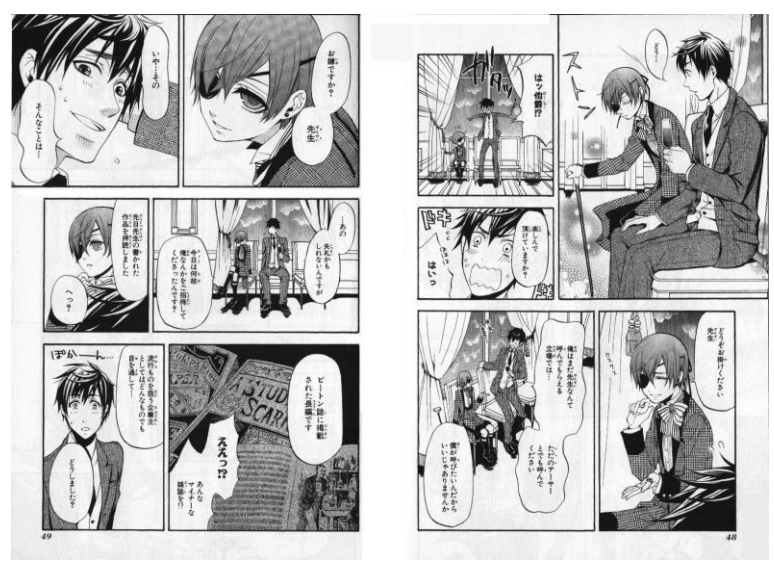
Figure 1: Arthur Conan Doyle meets Ciel Phantomhive in Toboso Yana, Kuroshituji, [ Black Butler ], volume 9: 48-49

A conversation about the merits of (and lack of critical appreciation for) Doyle's detective fiction follows. Doyle self-deprecatingly cites the critics who found fault with him for cobbling together stories without the requisite expertise, but Ciel remarks that he found Holmes a "new kind of character", both "witty and fascinating", and bemoans the fact that readers in such an "advanced" nation cannot appreciate him (Toboso 2010a: 50). 16 He tells Doyle to ignore the critics and focus on the popular success of his stories: "Let those guys say whatever they want. Sensei, you wrote with the masses in mind, didn't you? If they can enjoy it, then it's fine" (Toboso 2010a: 51). The stretch to suppose that Toboso, herself a rising star (Kuroshitsuji is her breakout title), creates correspondences between a young Doyle and herself: both on the cusp of immense popular acclaim, writing in genres that have been dismissed as 'mass-market' and in serial, ephemeral formats; each attempting to write "a new kind of character" that appealingly combines intellectual acumen and physical beauty with less salubrious traits (drug use, fiendishness).