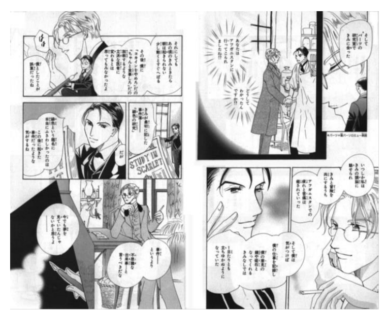
Figure 7: 'Doll-sized' Holmes and Watson discuss their first meeting in Moto Naoko, Dear Holmes , volume 2: 132-33. © Moto Naoko, Dear Holmes (Tokyo: Akitashoten, 2007).

hands (the same scene captured in the Hutchinson illustration discussed earlier). The dialogue reproduces that in A Study in Scarlet : "You have returned from Afghanistan, I see!?" "How did you know that!?" (Moto 2007: 132).<sup>30</sup> The bottom two frames of the page, moving back to the present time, show Watson and Holmes facing each other in close-up three-quarters' profile, with Watson's cigarette smoke seeming to drift into Holmes's frame and Holmes's speech bubble invading the lines of Watson's frame. "Before I knew it, I was enchanted by your intellect", says Watson, "so, sharing adventures with you cured the pain and fatigue of Afghanistan" (Moto 2007: 132).<sup>31</sup> They appear to gaze with romantic intensity into one another's eyes, playing up the homoerotic intimacy that inspires so much fan fiction.<sup>32</sup> However, they also seem to be the same size. Moto creates the illusion that the gap between the past encounter and the present moment has closed.