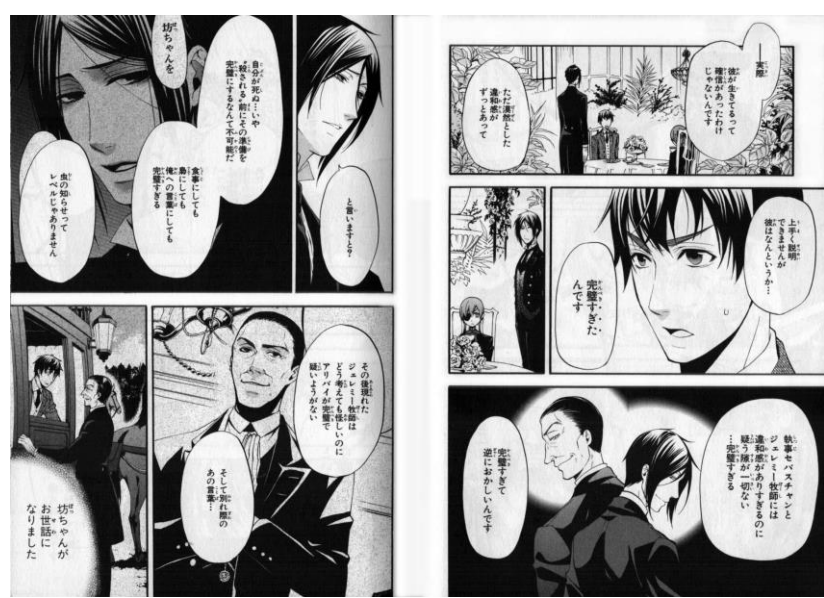
Figure 2: Doyle learns the true identity of 'Jeremy Rathbone' in Toboso Yana, Kuroshitsuji [ Black Butler ], volume 11: 10-11 © Yana Toboso, Black Butler (Tokyo: Square Enix, 2011).

The frame encourages perception of its figures as iconic: they are framed by twin halos of light against a solid black background, facing away from one another, in identical black jackets and white collars, heads tilted with the same sidelong glance outward toward the reader. Overlaying the Brett/Rathbone mash-up, Sebastian is a further refinement of classic Holmes images. Younger in appearance (though immortal in fact), elegantly androgynous rather than lean and slightly weathered like his predecessors, with superhuman abilities rather than merely human genius, the demon out-Holmeses Doyle's Holmes. Toboso's Doyle remarks on this uncanniness: