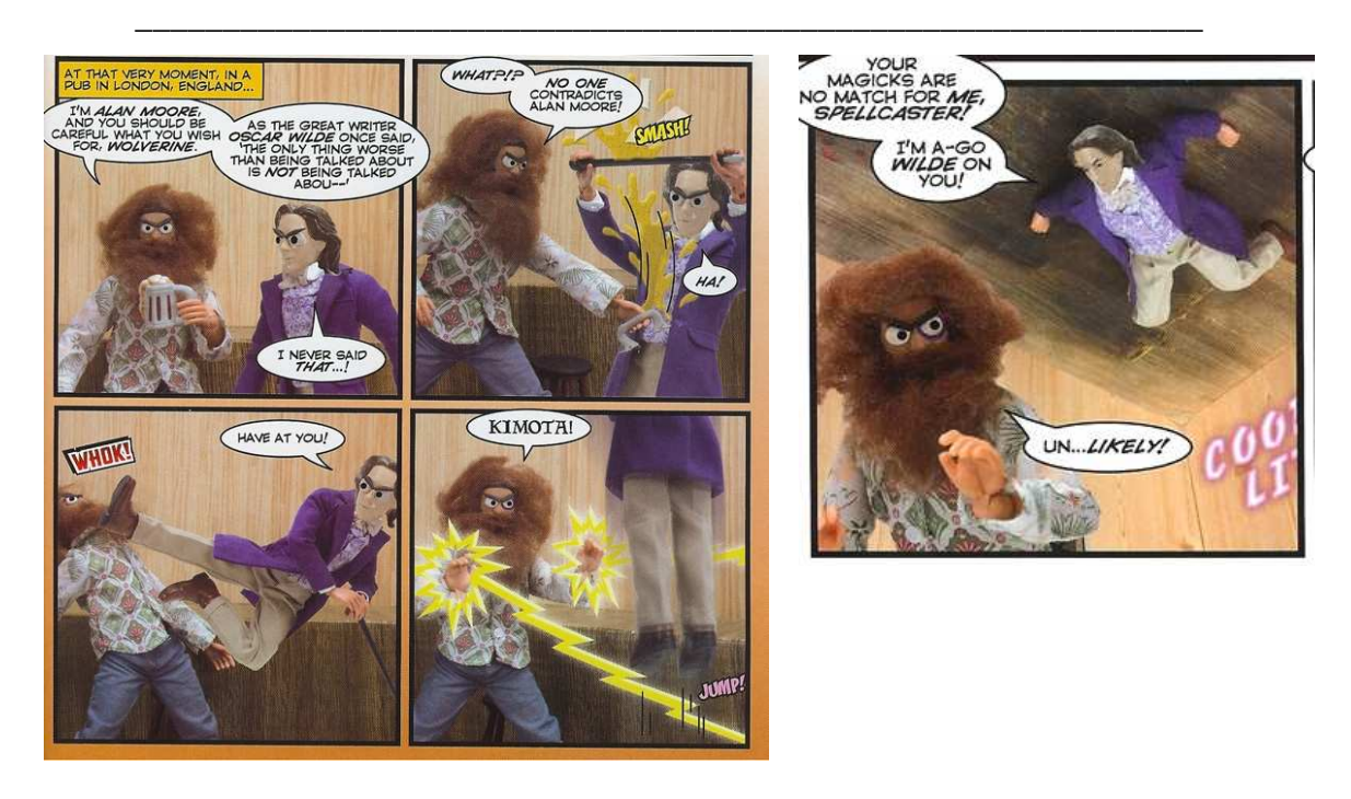
Figures 7 : Detail, from Twisted Toyfare Theater 106.

The Wilde emerging in these later comics is the Wildean persona both V for Vendetta and Ellmann's biography helped to create: self-possessed, aggressively strong when necessary, willing to fight to protect both his person and his aesthetic persona. Together, these late twentieth-century popular transformations of the Wilde story underscore its still-transformative cultural power and follow the general trend away from vengeance for towards vengeance from the Wilde figure.