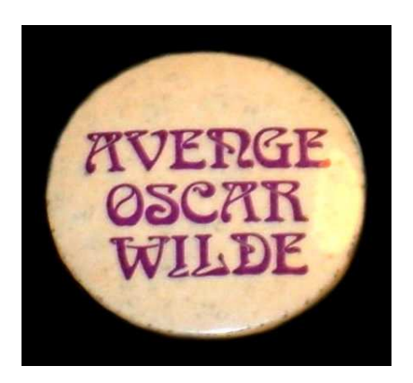
Figure 4 : "Avenge Oscar Wilde". Artist unknown.

dying in Paris in 1900. These letters played a large role in the transformation of Wilde from ultimate pariah and public menace at the start of the twentieth century into an object of pity and the first "gay martyr" towards its end. V for Vendetta 's use of the queer prison letter as vehicle for political transformation can therefore be understood as a provocative echo of Wilde's De Profundis and its potent afterlife in the history of queer activism – an afterlife vividly remembered in the purple gothic script of a protest badge from the early UK gay rights movement, shown below.