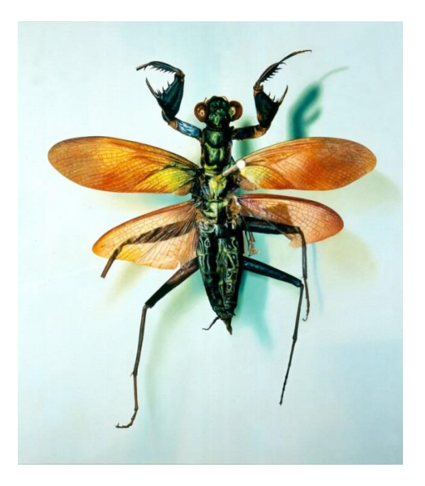
Figure 1. Mark Fairnington, Specimen (7), 2000. Oil on canvas, 214 x 189 cm, from the Mantidae series. © Mark Fairnington; reproduced with kind permission of the artist.

details that surely can only result from the artist's close observation of his subject's idiosyncrasies.