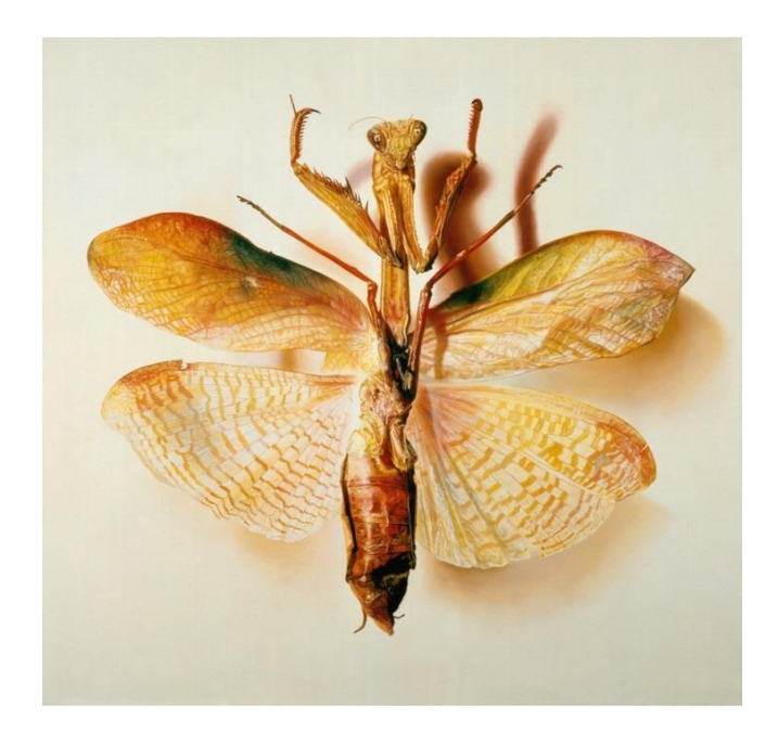
Figure 2. Mark Fairnington, Specimen (6), 2000. Oil on canvas, 203 x 214 cm, from the Mantidae series; © Mark Fairnington; reproduced with kind permission of the artist.

how, and why, nature's creatures are collected at all. Victorian attitudes towards nature are exemplified by these sites of the collection, display, and study of what an apparently endless and abundant natural world. As Sally O'Reilly highlights in her discussion of the Mantidae works, in this period "issues of colonialism and cultural subjectivity were not integral to the considerations of a keeper or curator, and knowledge was deemed absolute and unconditional" (O'Reilly, 2005), implying a reflective encounter between contemporary and Victorian attitudes towards the natural environment to be performed across the canvases.