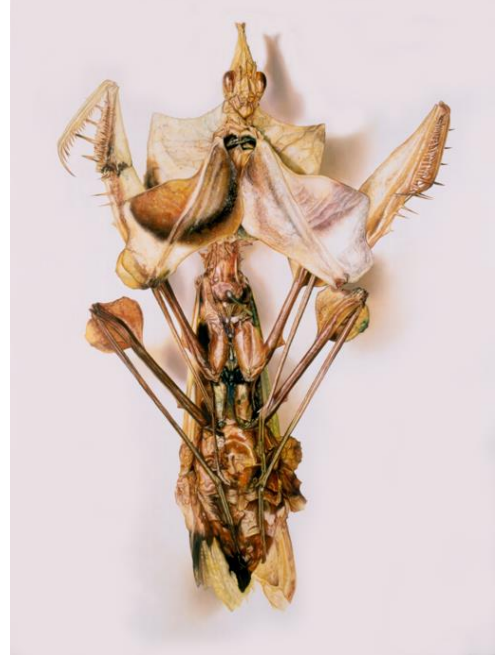
Figure 4. Mark Fairnington, photo-montage for Specimen (5), 2000. © Mark Fairnington; reproduced with kind permission of the artist.

Photography in the Victorian period, too, offered a novel way to "collect directly from nature" (Armstrong 1998: 32). And despite the fact that producing photographs in the nineteenth century was far more labour